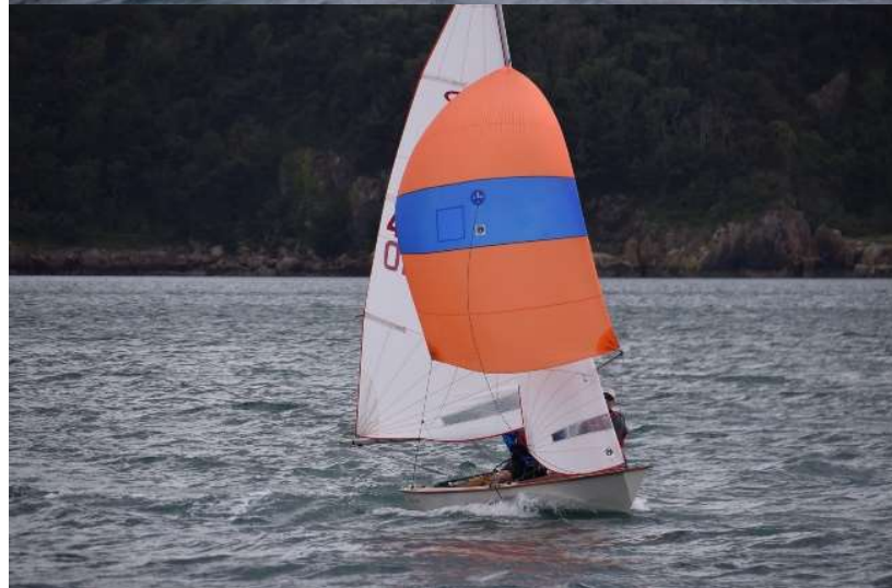
Aug-2023 Nationals at Brixham YC